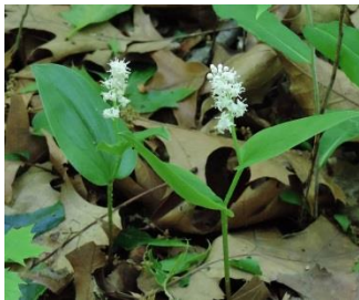
Canada Mayflower Cave Springs

At the Decew House walk we had the good fortune to find a Juvenal's Duskywing.