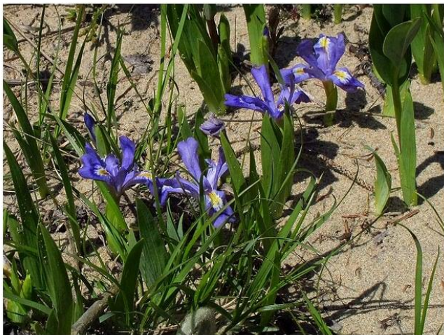
DWARF LAKE IRIS