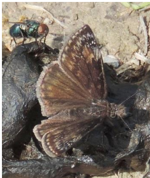
Juvenal's Duskywing Decew House