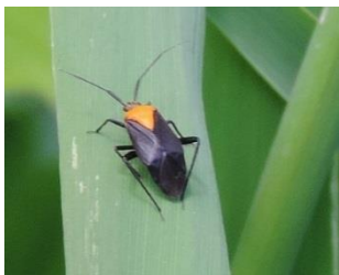
Prepops insitivus Sherkston