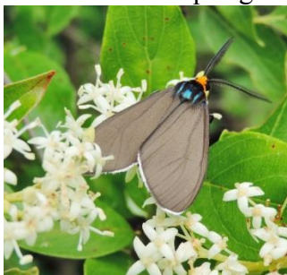
Virginia Ctenucha Moth Sherkston